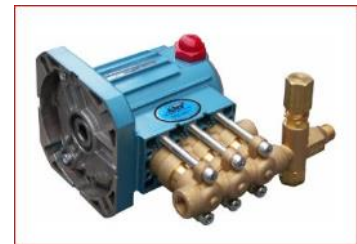
Pumps and Parts